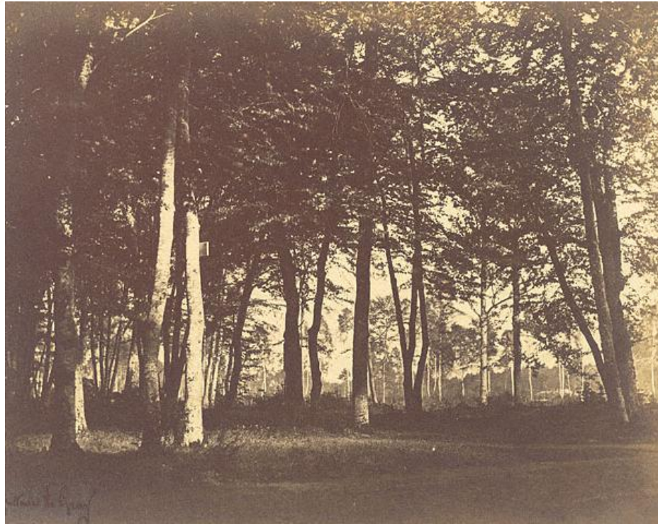
Study of Trees and Pathways