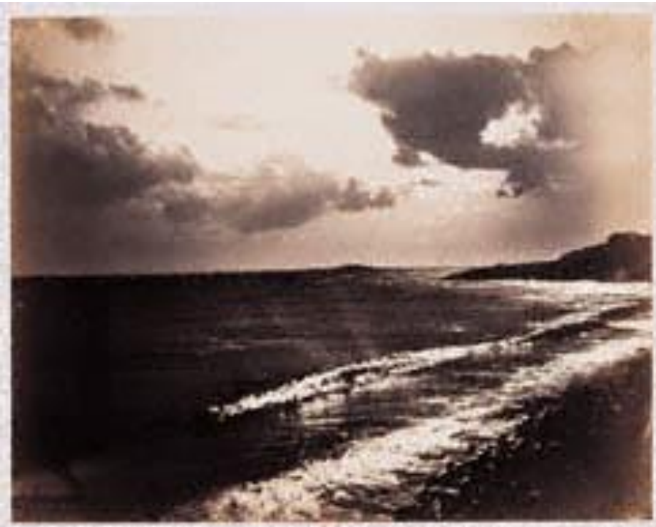
Large Wave, Mediterranean Sea