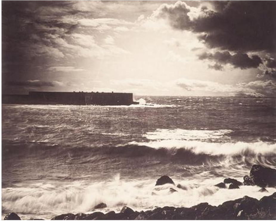
The Great Wave