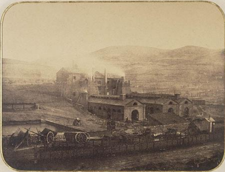
Factory at Terre-Noire