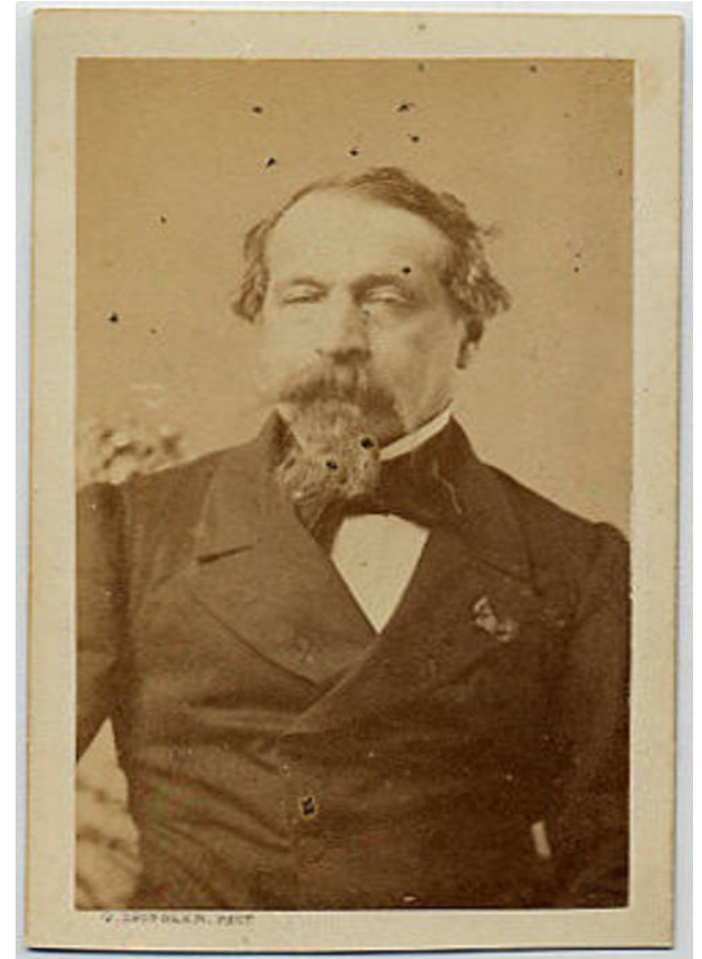
Le Gray’s photo of Napoleon III.