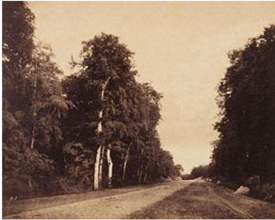
The Road to Chailly, Fontainebleau