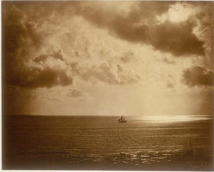
Brig on the Water