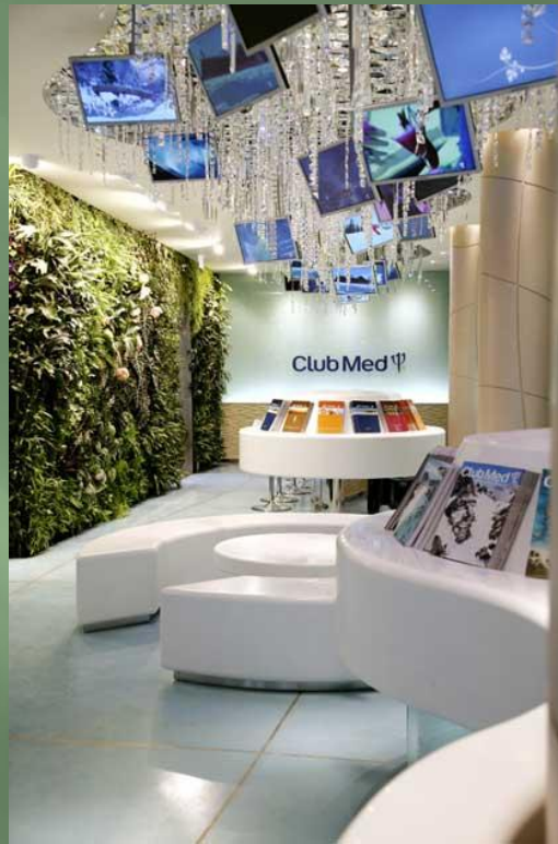
Bangkok Emporium Shopping Center, Thailand