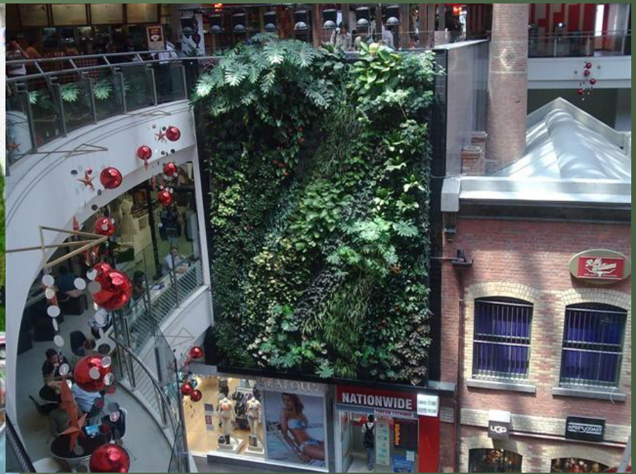
Melbourne Central, Australia