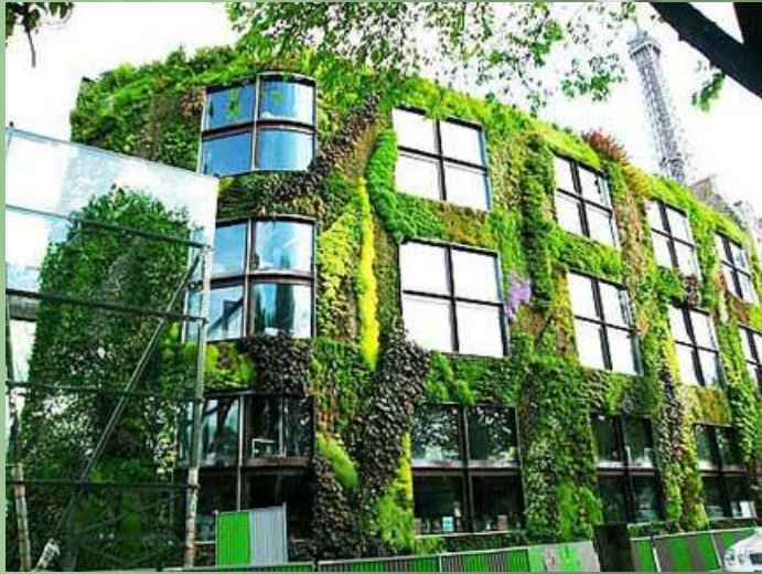
Musee du quai Branly, Paris