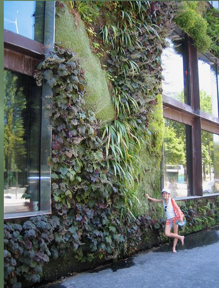
Musee du quai Branly, Paris