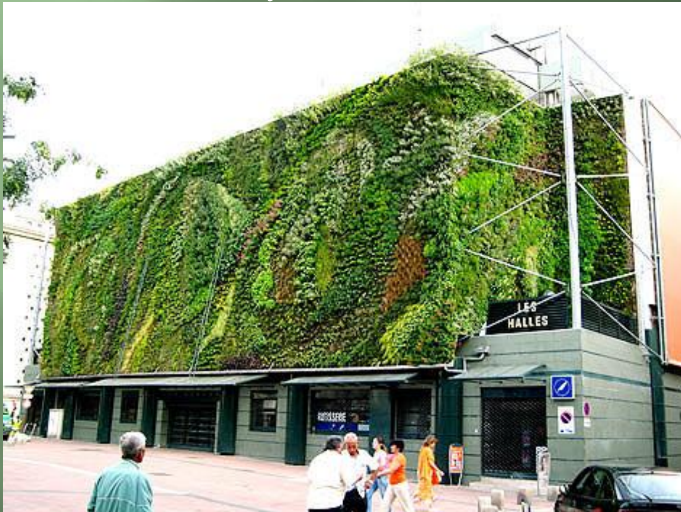
Marches des Halles, Avignon