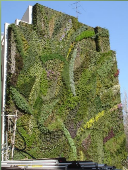
Caixa Forum, Madrid