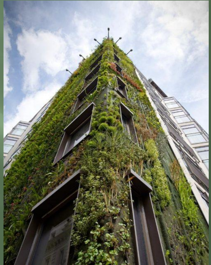
Athenaeum Hotel, London