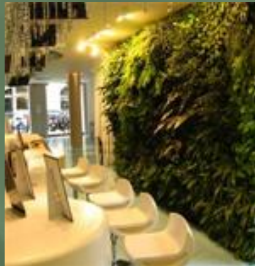
Club Med, Paris