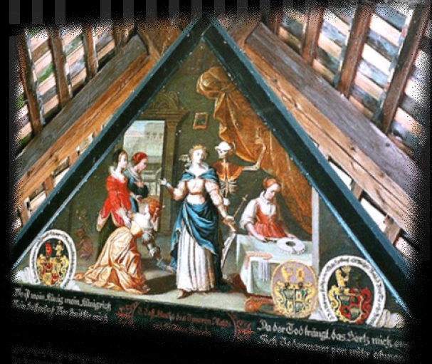
Das ist mein Kind, mein Allergnädigster Herr, der Tod frängt das Deyts nicht an sich, so der Tod frängt das Deyts nicht an sich, so der Tod frängt das Deyts nicht an sich.