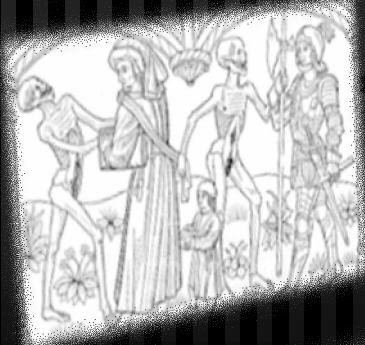
Death Figure 1