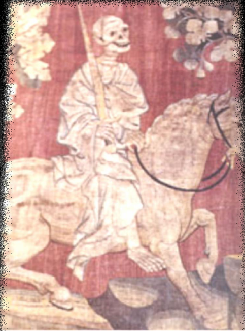
Death Figure 10

Now step forward, no lament will help you, you must bear your fate yourself.