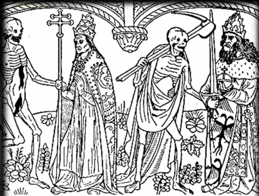
Death Figure 5 Death Figure 5