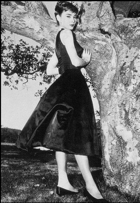
The little black dress